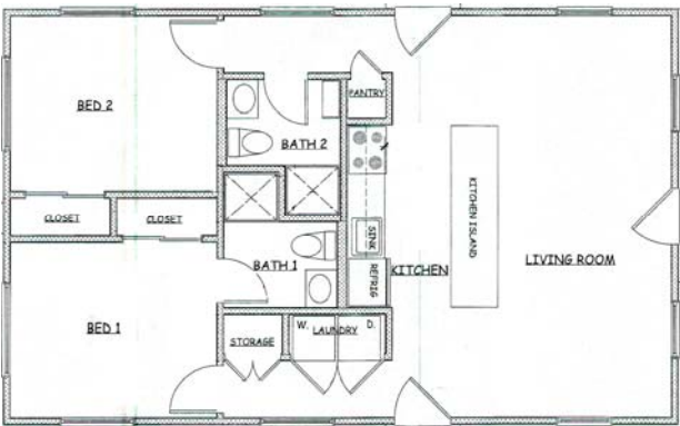
Secondary Dwelling Unit - Floor Plan